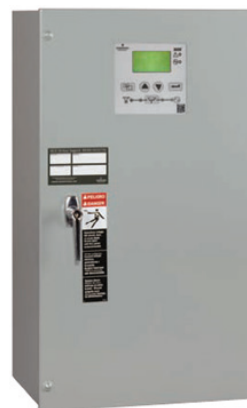
ASCO 4000 AND 7000 SERIES AVAILABLE