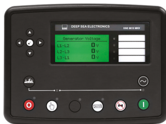
Synchronising & Load Sharing Control Module

The DSE7310 MKII is a powerful, new generation auto start genset control module with a highly sophisticated level of new features and functions, presented in the usual DSE user-friendly format. Suitable for a wide variety of single, diesel or gas Gen-set applications.